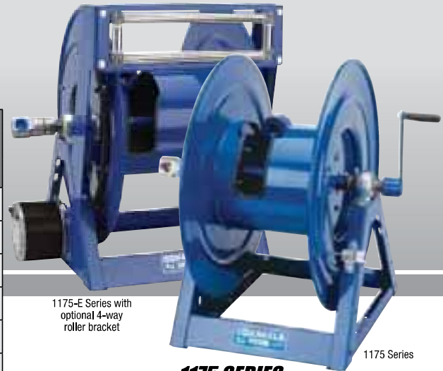
1175-E Series with optional 4-way roller bracket